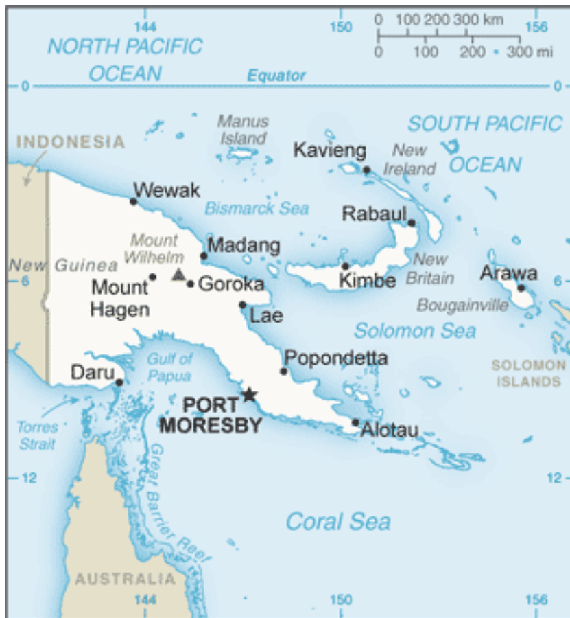
Figure : Map of Papua New Guinea