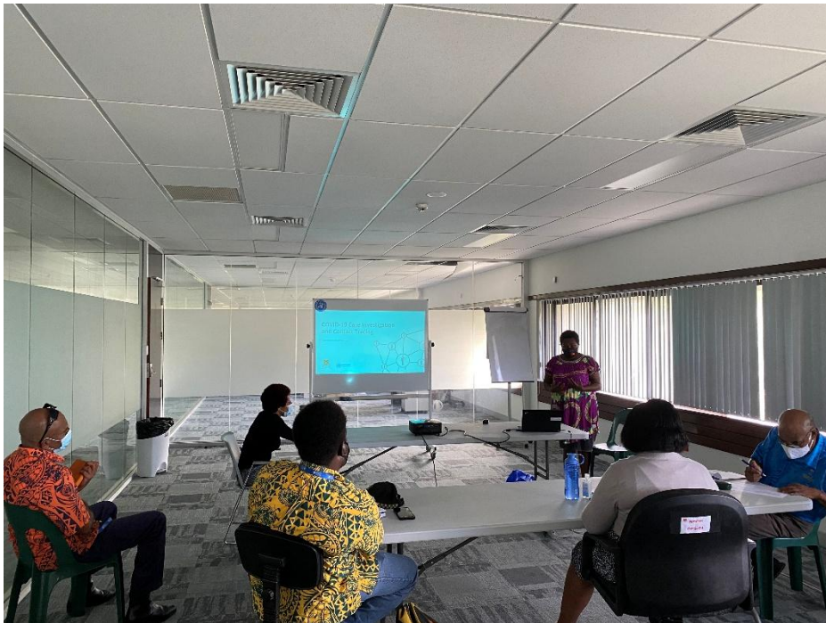
Photo 2-3: Contact Tracing Training for UNDP staff to support NCD PHA.

For more information about this Situation Report, contact: